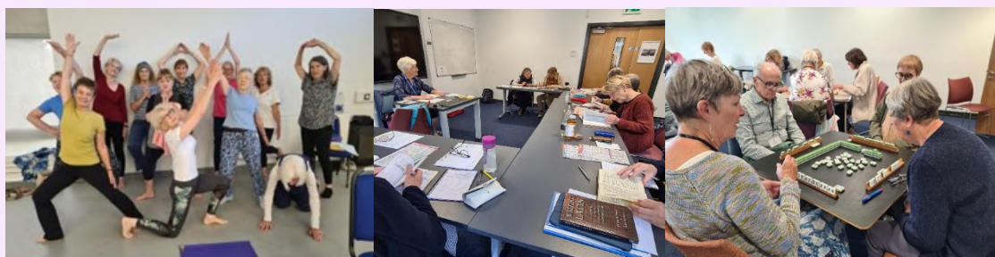
All images are from Summer School 2025

https://southeastu3aforum.u3asite.uk/2026-2/